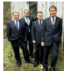
Dry Branch Fire Squad (Fri)