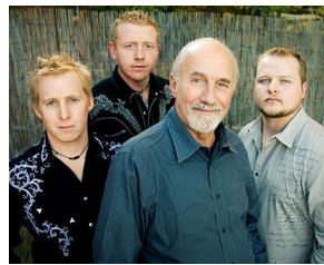
Special Consensus (Fri)