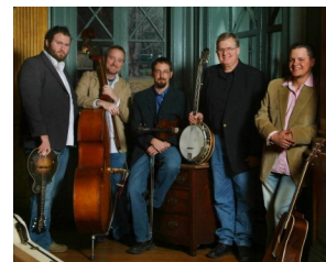
Balsam Range (Sat)